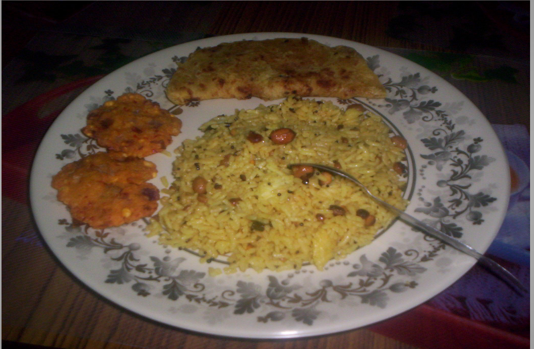
TAMARIND RICE WITH SWEET CHAPATI AND VADA www.makemegenius.com Free Science Videos for Kids