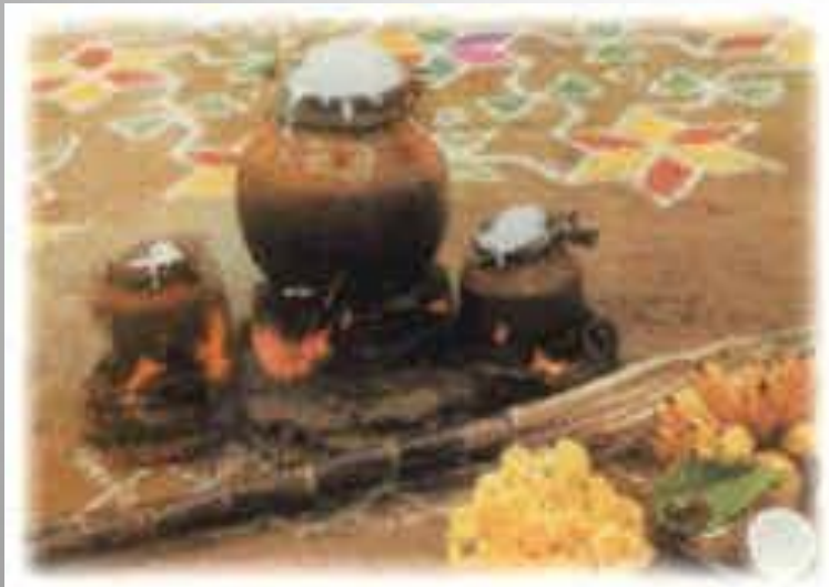
Traditional way of cooking Pongal in a clay pot.